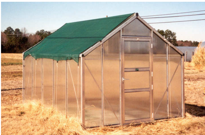
Example of our 12' wide green shade fabric installed on a Juliana greenhouse.